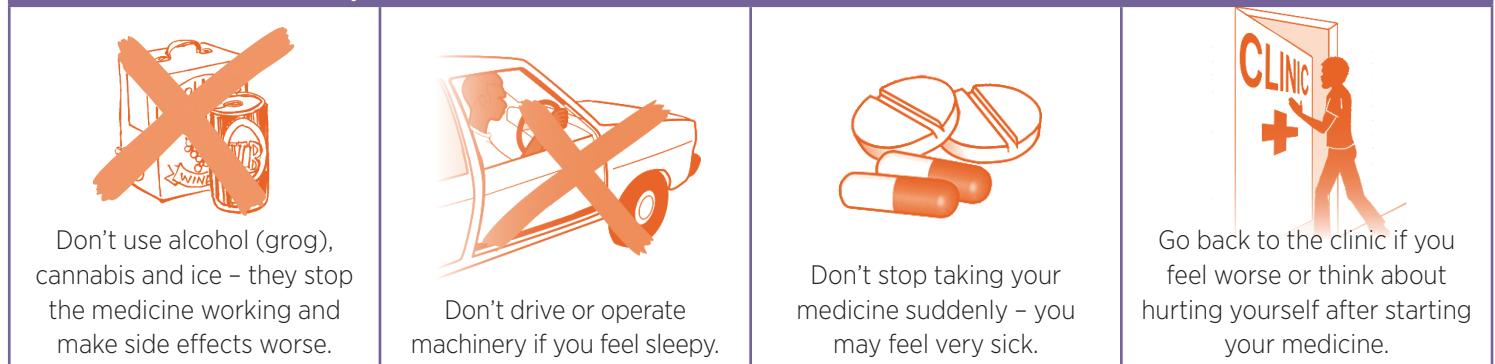
Illustration source: Centre for Remote Health (2014). Medicines Book for Aboriginal and Torres Strait Islander Health Practitioners and Health Workers (3rd Edition). Alice Springs: Centre for Remote Health.