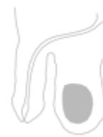
Scrotum - The skin sack that holds the testicles

Always apply ANDROFORTE® 2 cream to clean dry skin. The best area to use ANDROFORTE® 2 is the scrotum (the skin sack that holds the testicles). This is the recommended site of application because absorption is greatest from this part of the body. If a dose greater than 1.5 mL (30 mg testosterone) once daily is required it is recommended that ANDROFORTE® 5 testosterone cream be used. Many men experience a warming sensation of the scrotal skin for a few minutes after applying ANDROFORTE® 2 - this is normal and quickly subsides. No perfume, deodorant, or moisturizing creams or gels should be used on the area because this may interfere with ANDROFORTE® 2 from being absorbed.