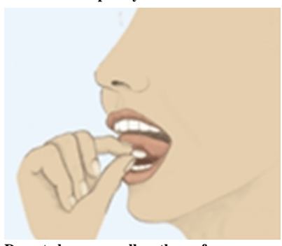
Do not chew or swallow the wafer. Do not eat or drink for 10 minutes after taking the wafer.

Otherwise SAPHRIS will not be absorbed completely and it may not work as effectively.