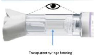
Transparent syringe housing